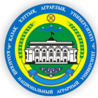
Kazakh National Agrarian University